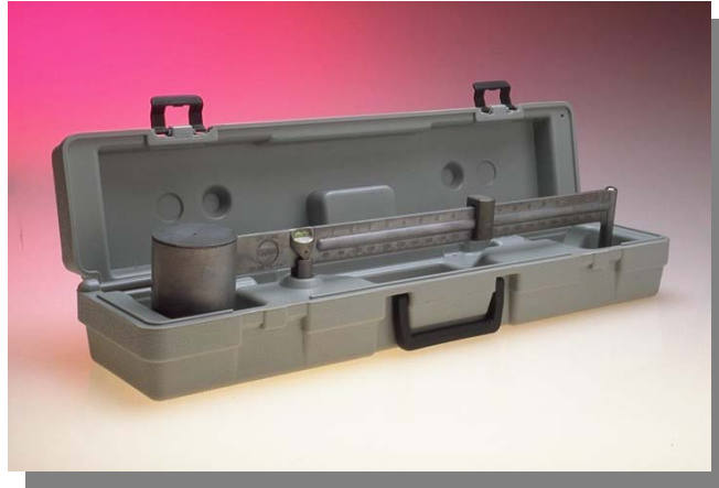
Mud Balance Model 140

The Fann Model 140 Mud Balance provides a simple, practical method for the accurate determination of fluid density. It is one of the most sensitive and accurate field instruments available for determining the density or weight-per-unit-volume (specific gravity) of drilling fluids. An outstanding advantage of this Mud Balance is that the temperature of the sample does not materially affect the accuracy of readings. The Mud Balance is constructed with an easy to read beam which is graduated into four scales: pounds per gallon, specific gravity, pounds per cubic foot, and pounds per square inch per 1,000 feet of depth.