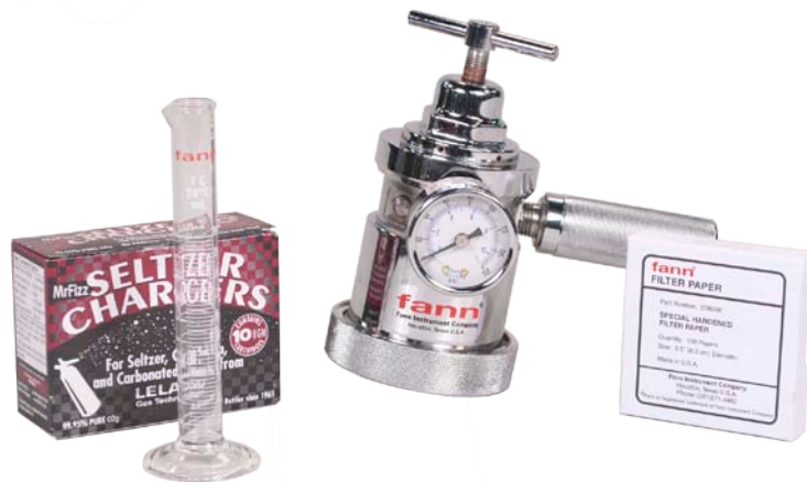
Figure 3-1 Half Area Filter Press Kit