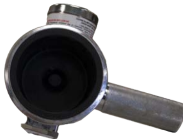
Figure 5-2 Rubber Boot inside cell