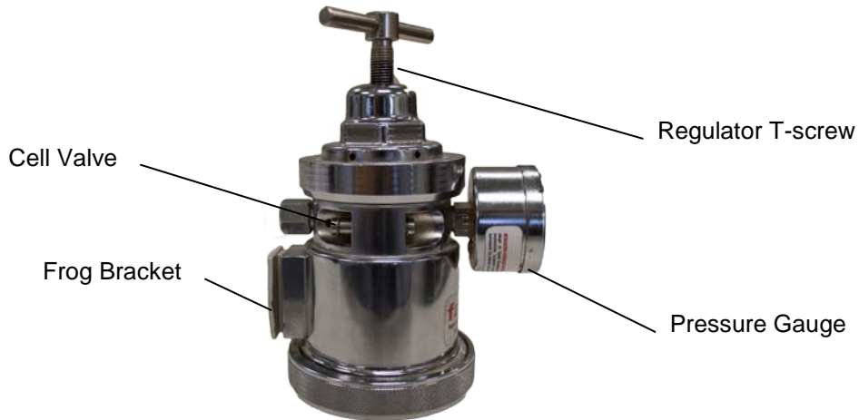
Figure 5-3 Half Area Filter Press Cell